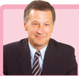
Welcome by TV broadcaster and presenter, Stewart White

KingsGate Conference Centre, 2 Staplee Way (off Parnwell Way), Parnwell, Peterborough, PE1 4YT