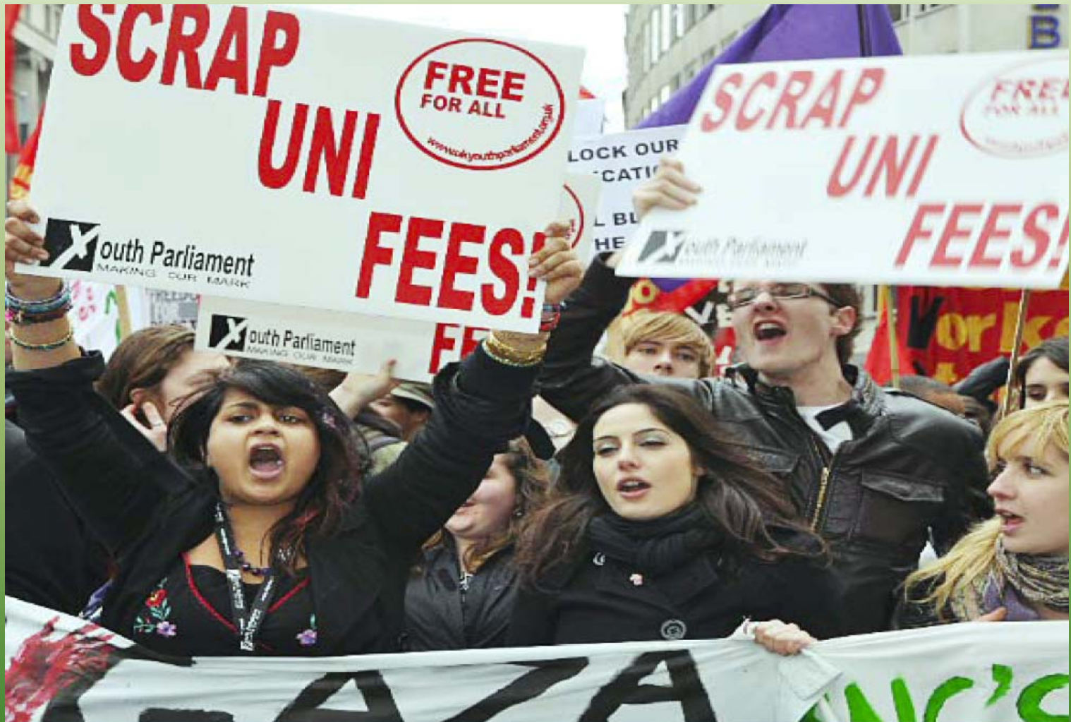
Members of Youth Parliament protest against university tuition fees in the streets of Birmingham